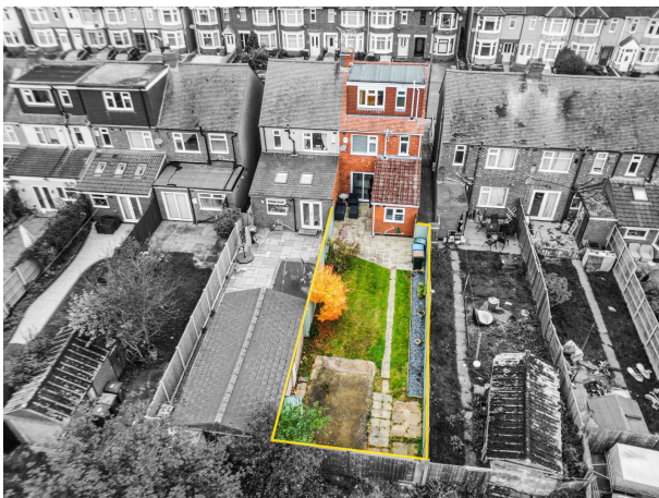
68 Benson Road, Coventry, CV6 2FE Approximate Gross Internal Area 1324 sq ft - 123 sq m